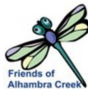
Friends of Alhambra Creek