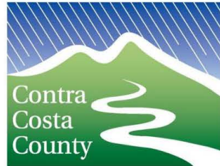
Contra Costa County Flood Control & Water Conservation District