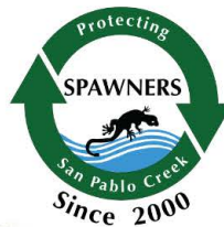
Protecting SPAWNERS San Pablo Creek Since 2000