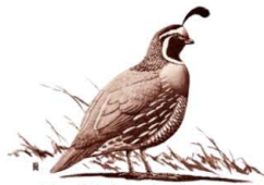
Mt. Diablo Audubon