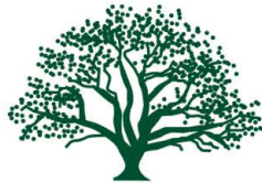
East Contra Costa County Habitat Conservancy